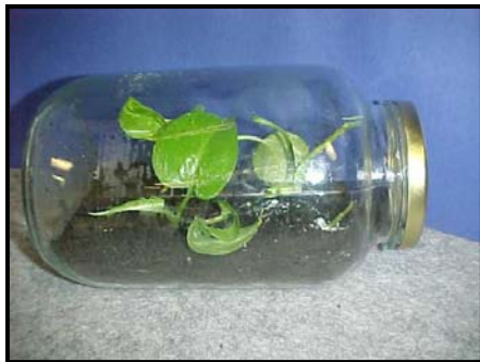
February 26, 2003 system started

It's been 7 months so far, and, as you can see, the plant is thriving.