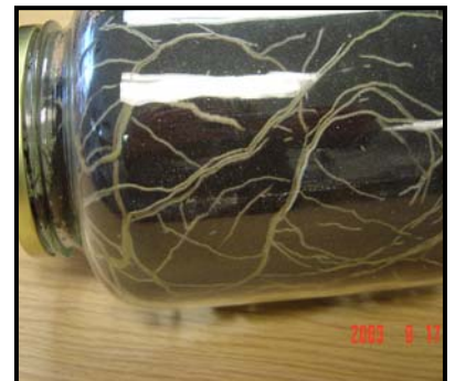
System 7 months later