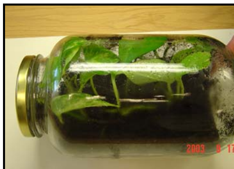
System 7 months later